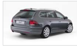
Golf Wagon 103TDI 7