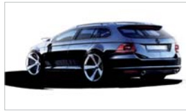
Golf Wagon Detail 6