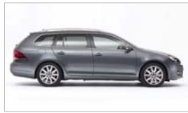
Golf Wagon 103TDI 6