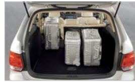
Golf Wagon Interior 3