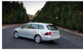
Golf Wagon 118TSI 6