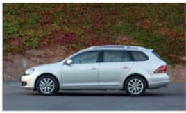
Golf Wagon 118TSI 5