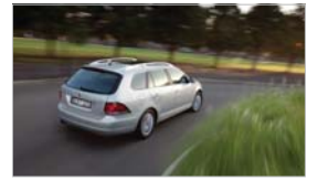
Golf Wagon 118TSI 8