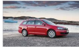
Golf Wagon 118TSI 3