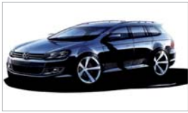
Golf Wagon Detail 5