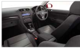
Golf Wagon Interior 2