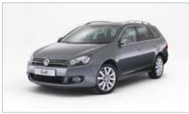
Golf Wagon 103TDI 5