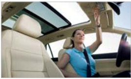
Golf Wagon Detail 1