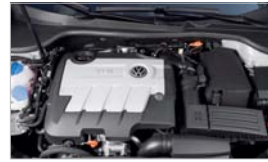
Golf Wagon Engine TDI