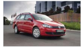
Golf Wagon 90TSI 1