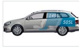
Golf Wagon Detail 3