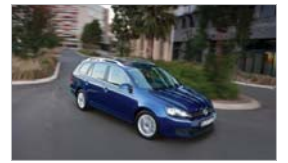
Golf Wagon 103TDI 4