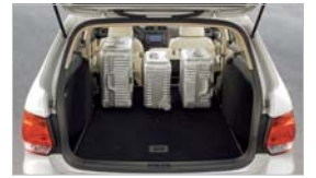
Golf Wagon Interior 4