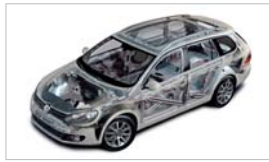
Golf Wagon Detail 2