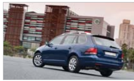
Golf Wagon 103TDI 2