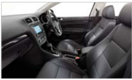
Golf Wagon Interior 1