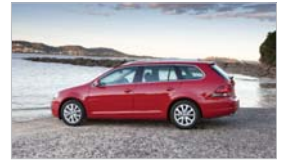
Golf Wagon 118TSI 4