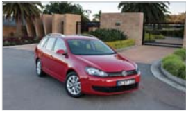
Golf Wagon 118TSI 1