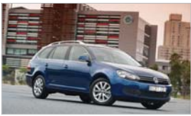
Golf Wagon 103TDI 1